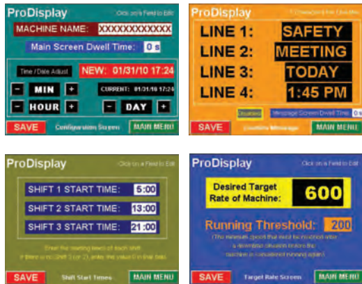
Remote view configuration screens

The ProDisplay™ system arrives pre-programmed to your specifications. Remote view configuration screens allow the user to view current running statistics, easily modify Target Rates and Goals, and create a custom “Message of the Day” display directly from your desktop. No software to install, maintain or support.